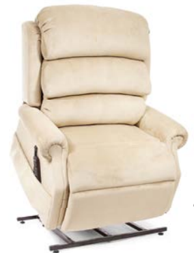
UC550-M26 For people 5'3" - 5'10" with 500 lb. weight capacity and 26" seat width

The StellarComfort Collection offers the most comfort of any lift recliner. Each model comes standard with the StellarComfort positioning technology, allowing the backrest and footrest to work independently to create positions that place the feet above the heart and reduce lower back pressure.