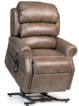
UC550-JPT For people 5'2" or under