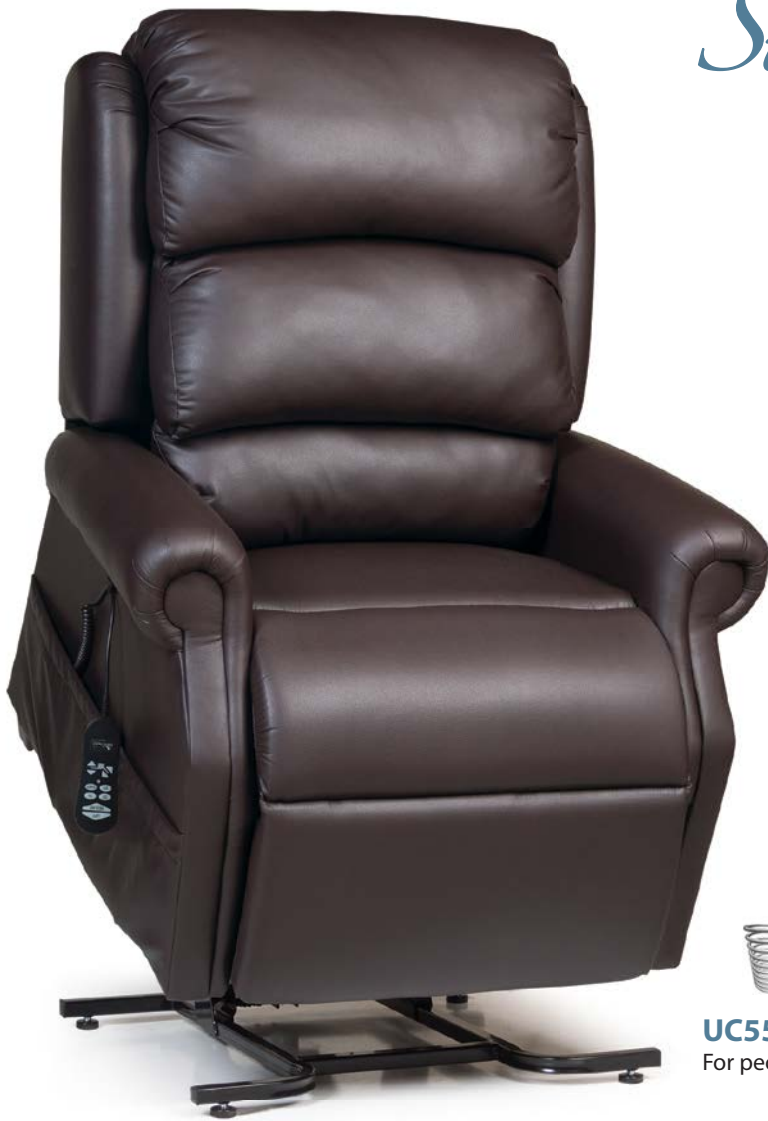
UC550-M For people 5'3" - 5'10"