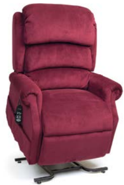
UC550-L For people 5'11" - 6'2"