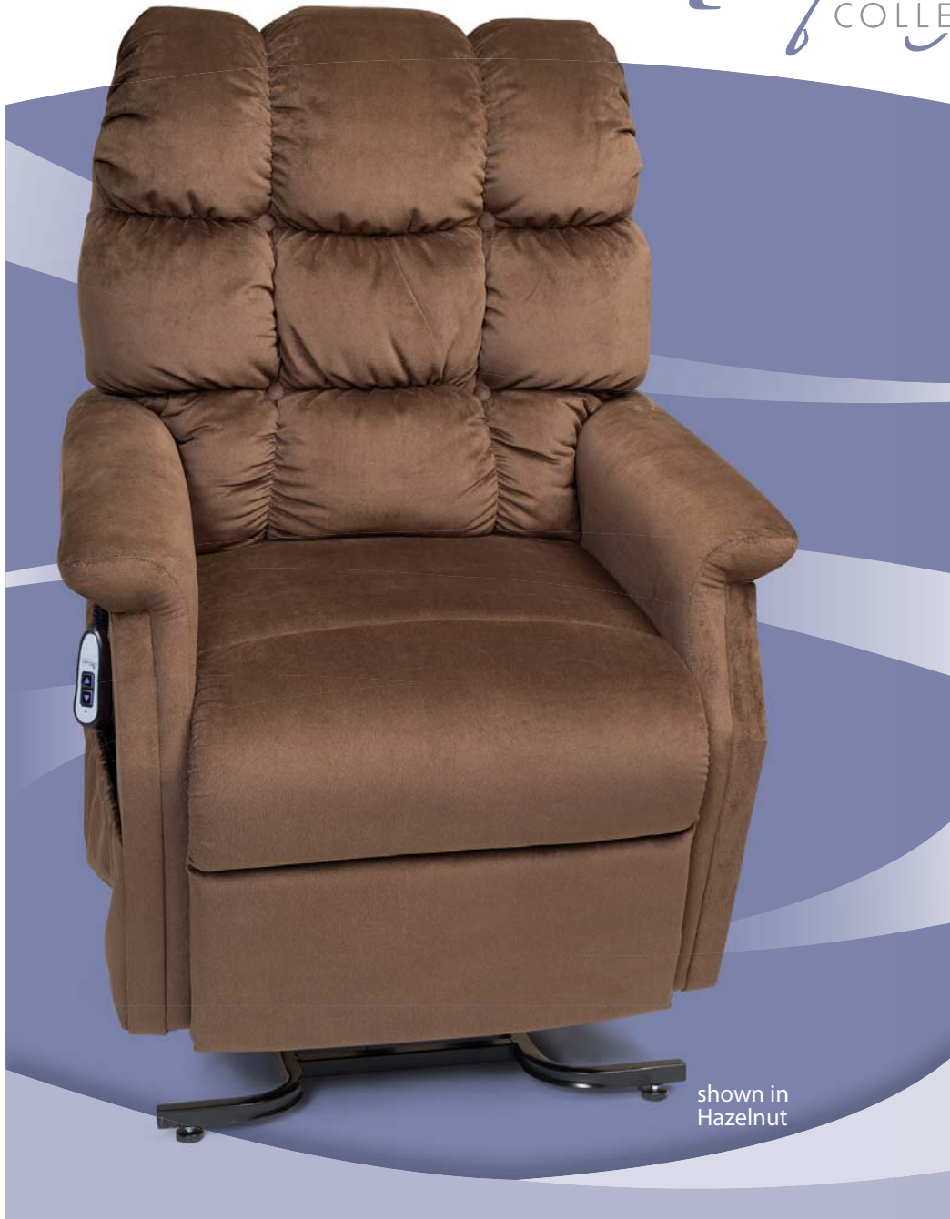
shown in Hazelnut