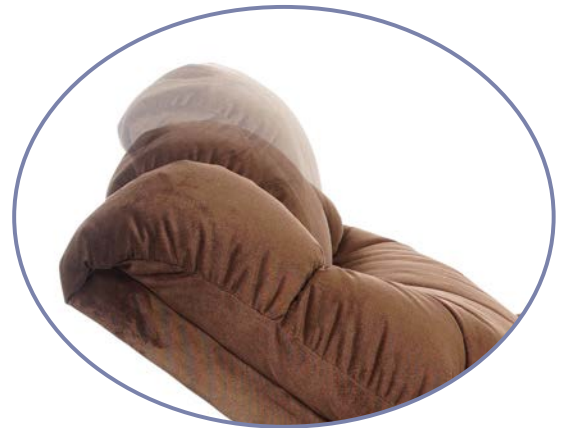
Power Articulation Head

Looking for a power lift recliner you can sink into after a long day? The UC482 offers an oversized, extra plush back and a pocketed coil seating system which provides hours of relaxation. For added comfort and support, this design is available with an adjustable, articulating headrest as a UC484.